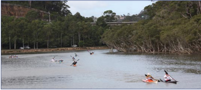
Some of the great views at Lane cove race